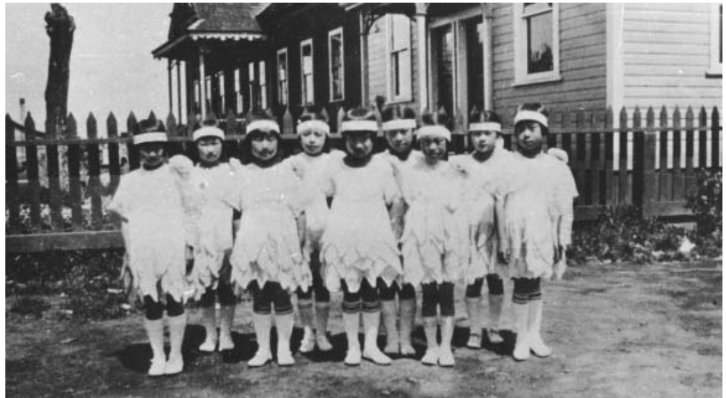
Photograph of students in traditional May Day dress standing outside the Steveston Japanese School, May Day, 1930. The Steveston Fishermen's Hospital is the building to the far left, and the doctor's and hospital offices (in the original location, now 4091 Chatham Street) is the building to the right.